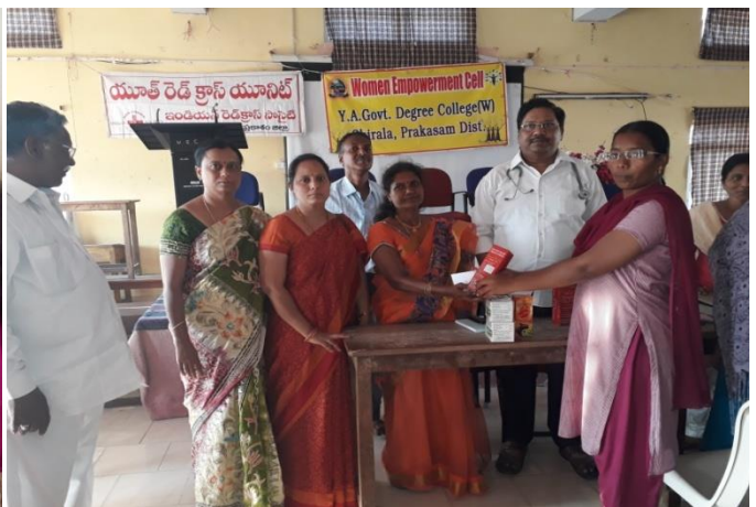
Free Medical Camp and distribution of medicine