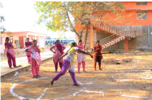
shotput college intramural competitions