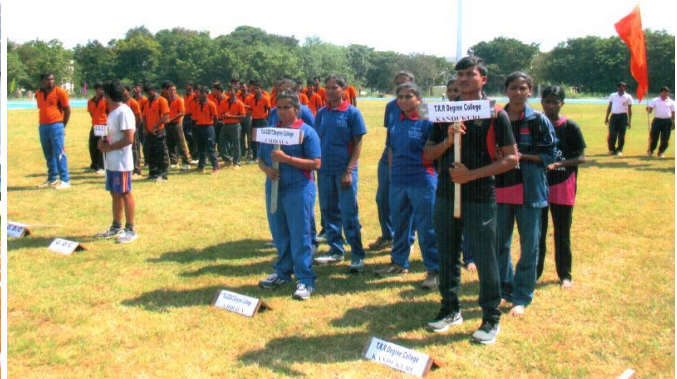
university athletics opening meet at anu campus