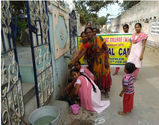
NSS Volunteers involved in Plantation program at Epurupalem