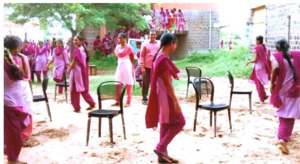
musical chair event on national sports day