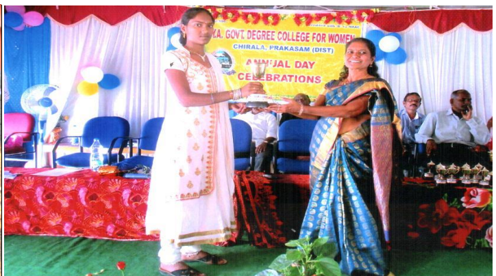
College individual championship