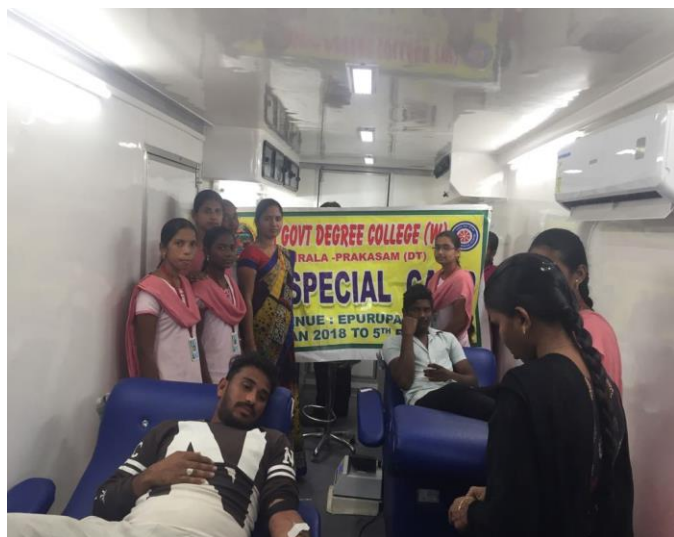
NSS Blood Donation Camp at Epurupalem, collected 19 units of blood and Donated Red Cross Society, Chirala

The college has one NSS unit with 124 volunteers. NSS special camps, awareness programs, Aids awareness campaigns, red-ribbon programs and many other activities are organised by the NSS unit as per the guidelines of the program coordinator of NSS Acharya Nagarjuna University, Guntur.