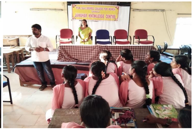
Awareness program on 'Personality Development' by Director, Global Institute, Guntur