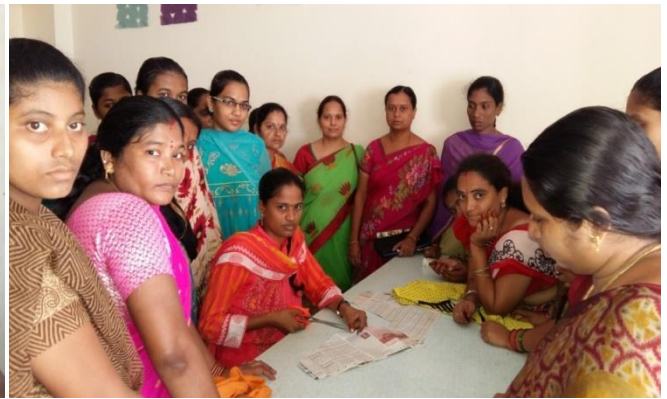
Certificate course in Fashion Designing