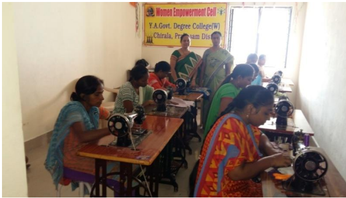
Certificate Course in Tailoring