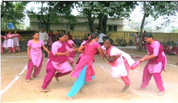
college intramural kabaddi