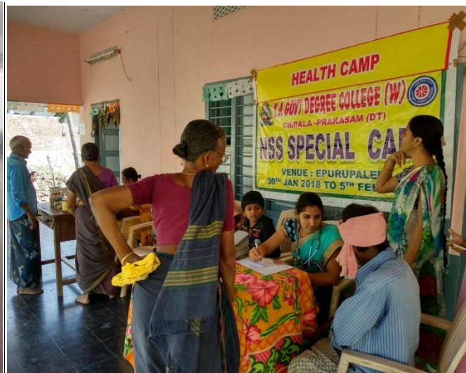
Free Ayurvedic Medical Camp conducted at Epurupalem in NSS Special Camp