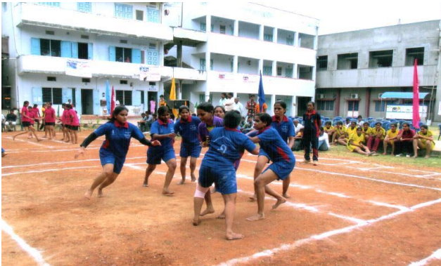
ANU Inter collegiate Kabaddi Tournament at Mangalagiri

The Department of physical education of the college involves the student's regular sports activities in the campus. The students are also encouraged to participate in the tournaments at various levels. The multi GYM room with a number of useful items is made accessible to the students daily for improving their physical fitness and mental soundness.