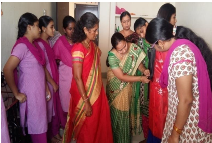
Certificate course in Beautician